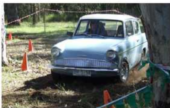
Graeme Hodges Great looking Ford Anglia

With a shower of rain on Saturday night damping down the course Sundays meeting went ahead on a perfect surface & with 20 competitors from GCTMC & other CAMs affiliated Clubs the competitors tackled 6 different courses which then left time for any Junior club members to take a car around the course either for their first chance to experience driving or ones that have driven in competition before to have a experienced driver coaching them on how to negotiate the course better.